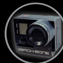
GO PRO HERO 4 (Specially modified)