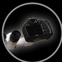
DIGITAL DSLR CAMERA (Sony, Canon, or Nikon)