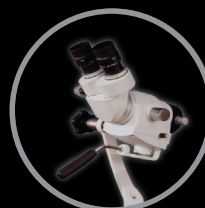
FIXED 45° HEAD FOR HRA PROCEDURES