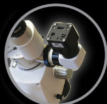
1080P HD STREAMING VIDEO