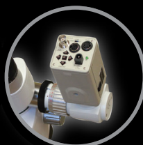
CCD S-VIDEO CAMERA (Use with Image Capture System)